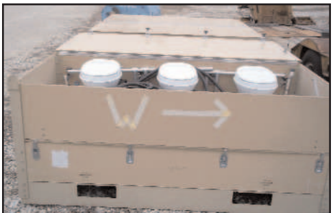
Field Commodes 1 set $500.00

Closed February 13th Lincoln Day (observed) February 20th Washington's Birthday