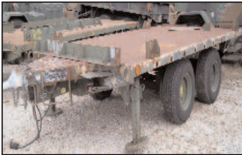
1989 Flatbed Trailer 5 ton/SN:009492 $2,500.00

Closed February 13th Lincoln Day (observed) February 20th Washington's Birthday