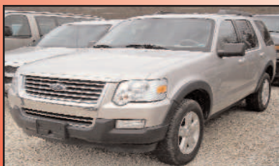
2007 Ford Explorer XLT 4x4 6CYL,AT,PS,PB,PW,PL,AC,CC,TILT Mileage: 70,342 $12,900.00

Visit our website for vehicle listings and pictures!