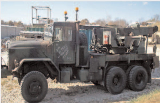
1984 Wrecker, 5 ton, 6 x 6 31,663 miles SN: C536-00675 $7,500.00