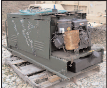
Diesel Pressure Washer $750.00