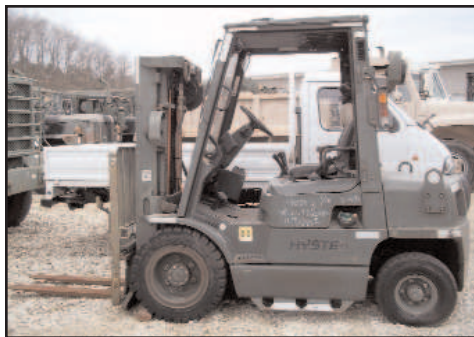
Forklift/SN:D177G201115 4,000 lb lift capacity Hyster/$3,500.00