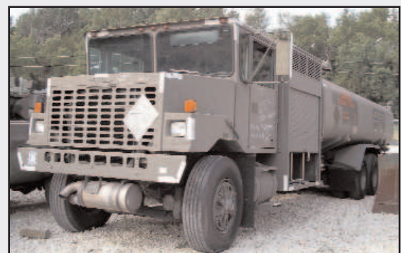
1990 Tanker Truck Mfg: Osh Kosh, 6,000 Gallon $8,000.00 Reduced!