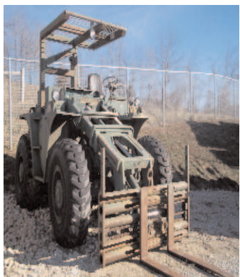
1972 All Terrain Fork Lift 6,000 lb capacity, runs well Athey Products $6,500.00