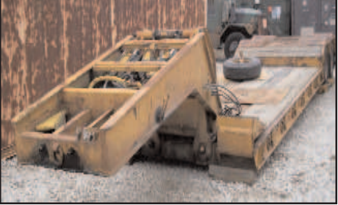
Trailer, 35 ton Talbert Mfg. Model: TD-35-HRG-1 Detach, $12,000.00