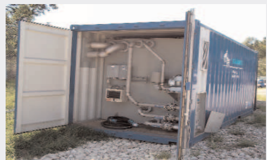
Waste Water Treatment System mfg: Clearbrook $10,000.00