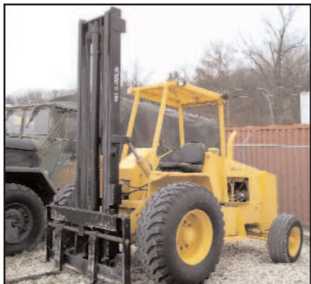
Forklift Construction, 2395 hrs. 6,000 lb capacity/Runs well Mfg: Allis Chalmers $6,000.00