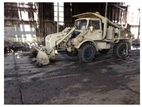
Industrial Truck - $4,500.00