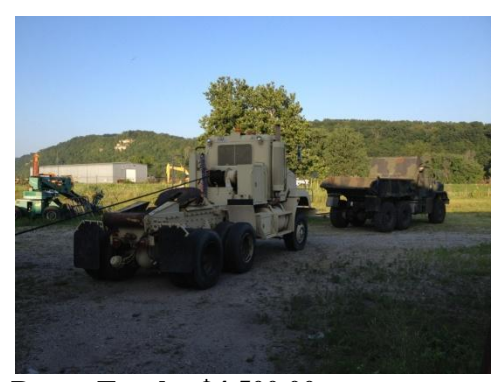
Dump Truck - $4,500.00 Freightliner Road Tractor - $3,000.00