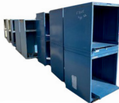
METAL STORAGE 30" x 28" x 67" $40 (Each)