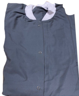
SHIRT Various sizes $3