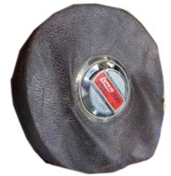
TAPE MEASURE Various lengths, shown here: 100' $2