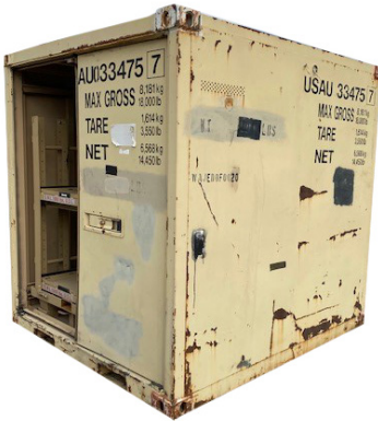
CONTAINER Adv Containment MFG, 8' x 7' x 8', has shelving, needs door repair, 18,000 lb $500