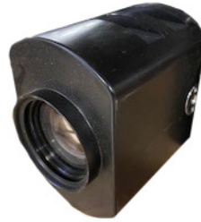
SURVEILLANCE CAMERA Tamron 483WE, 8-80 mm zoom lens $5