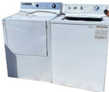
WASHER OR DRYER Assort. models $75 (Each)