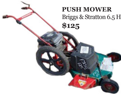
PUSH MOWER Briggs & Stratton 6.5 HP engine $125