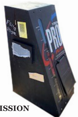
TRANSMISSION FLUID EXCHANGE T-Tech Pro Plus MFG $240