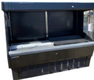
FOOD SERVING STATION Master Pitt MFG $400