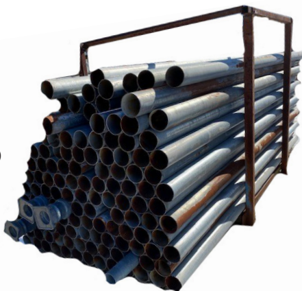
3" STEEL PIPE 10' length $.20 (A pound)