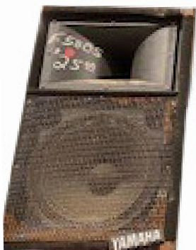
AMPLIFIERS Yamaha MFG, More options at our warehouse $25 (Each)