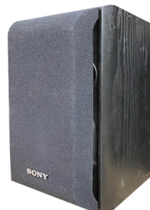
SPEAKERS Sony MFG $10 (Each)

NEW PROPERTY ARRIVES EACH WEEK AT OUR WAREHOUSE IN JEFFERSON CITY