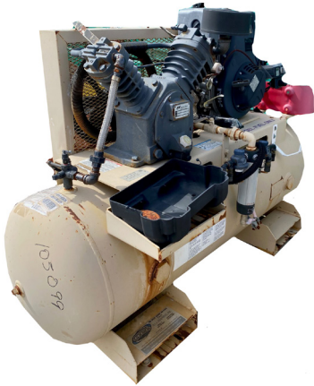
AIR COMPRESSOR All Equip MFG, S/N D0904300726, Diesel fuel only $500

OA.MO.GOV/GENERAL-SERVICES/SURPLUS-PROPERTY