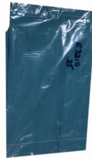
PILLOW CASE $0.25

ALSO AVAILABLE • Metal & Wood Shelves • File Cabinets • Tables • Office Supplies