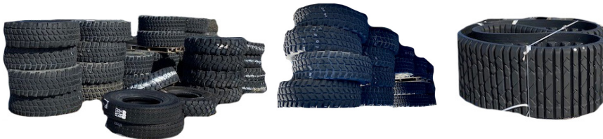
TIRES Various sizes and types $50-240 (each)