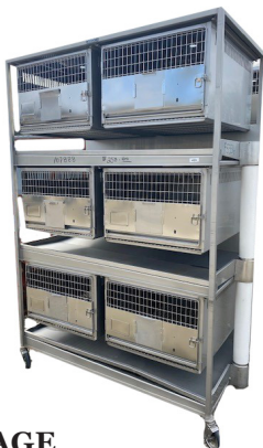
CAGE Three deck animal cage $250

VISIT OUR WAREHOUSE We have much more property to choose from at our Jefferson City location. We can't wait to see you!