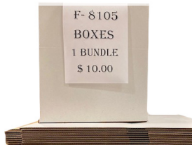
BOXES 16" x 13" x 10" $10 (per bundle of 25)