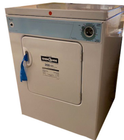
DRYER 110 V $75