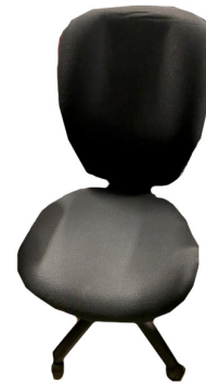
CHAIRS $25 (multiple varieties)