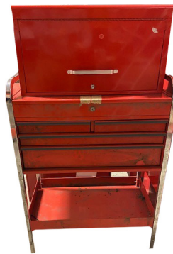
TOOL STORAGE $100