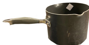
COOKING POT $3 (with lid)