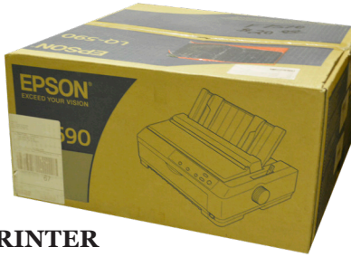
PRINTER Epson MFG, LQ 590, 24 pin technology, form printing $20