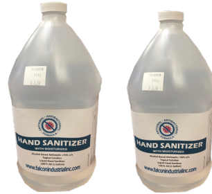
LIQUID SANITIZER $7.50 (per gallon)