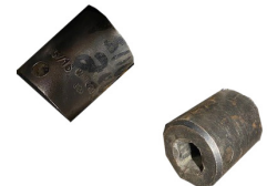
ASSORT. SOCKETS $2-5 (per piece)