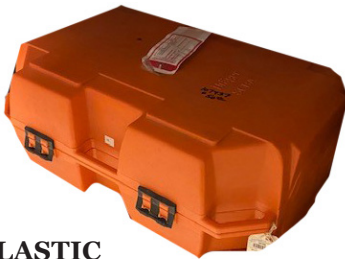
PLASTIC CONTAINER Portable tool storage $50