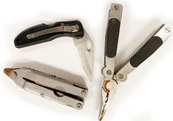
ASSORT. KNIVES $1-3