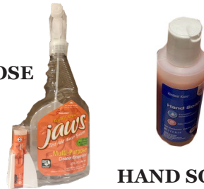
HAND SOAP $0.75 (4 Fl oz)