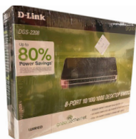
NETWORK SWITCH $10