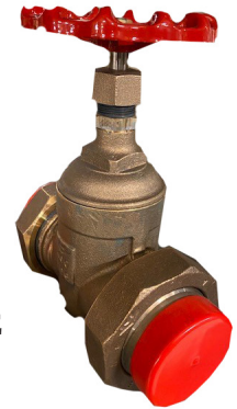
WATER VALVE $40