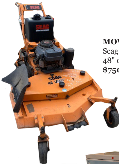
MOWER Scag MFG, S/N 0600380 48" deck $750

OA.MO.GOV/GENERAL-SERVICES/SURPLUS-PROPERTY