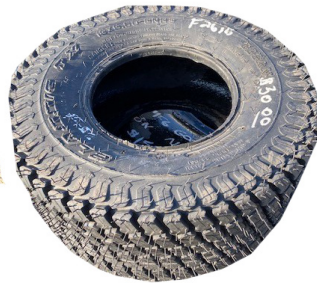
TIRES 18 x 8.5, 4 PLY $30 (each)