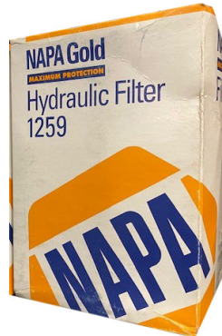
HYDRAULIC FILTER $2