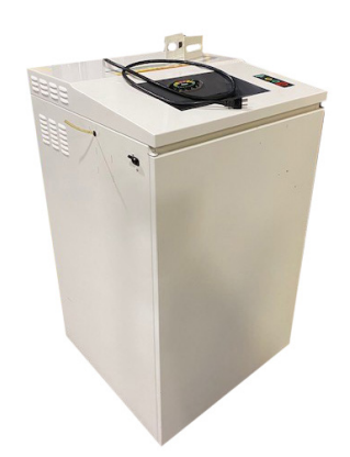
SHREDDER Dynamo MFG $240