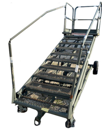
STAIR RISER PLATFORM Click here to find out more $750