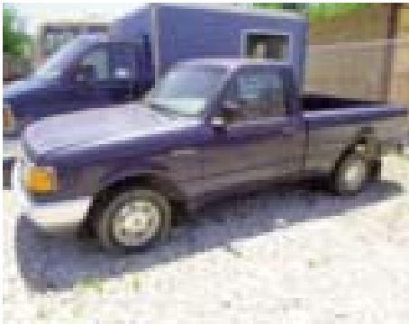
1997 RANGER MFG: FORD $2,000.00