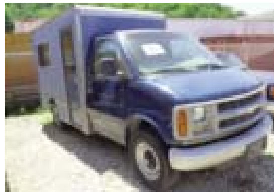
2001 CARGO VAN - MFG: CHEVROLET $2,500.00