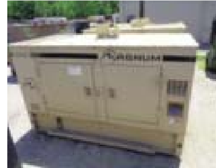
20 KW GENERATOR 120/208V, 3 PHASE MFG: MAGNUM PRICE REDUCED!! $1,750.00 WAS $2,500.00