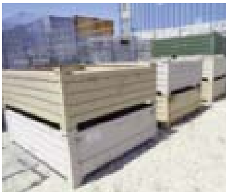
SHIPPING & STORAGE CONTAINER - $50.00