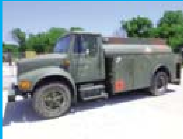
1994 TANKER TRUCK MFG: INTERNATIONAL $5,500.00