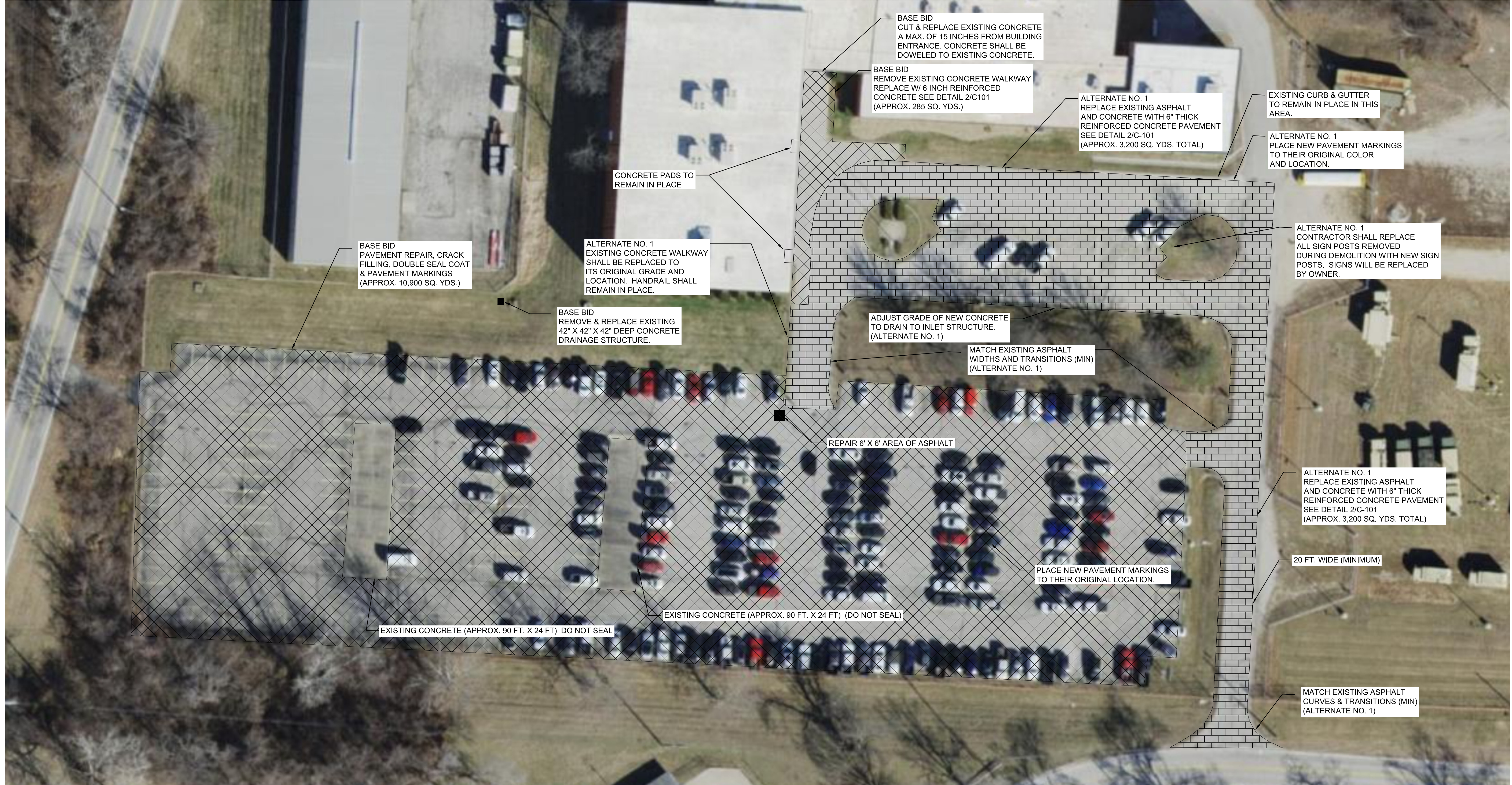
1 SITE PLAN C-101 SCALE 1\"/>