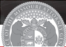
ERIC SCHMITT MISSOURI ATTORNEY GENERAL